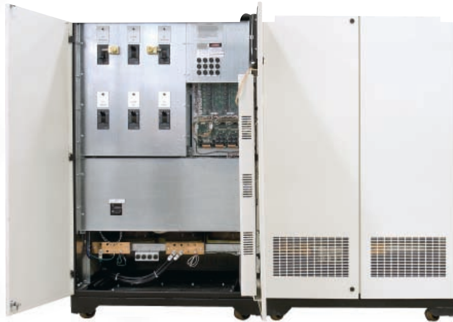
Front view of Zero Footprint showing system modularity

ZERO FOOTPRINT PROVIDES ADDED RELIABILITY TO ANY ARCHITECTURE